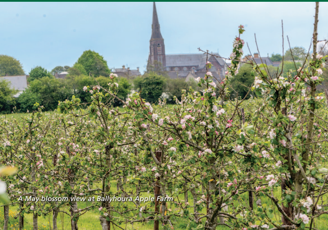
A May blossom view at Ballyhoura Apple Farm

As with any adjustments to your farm animal feeding programme, always make gradual changes and introduce Fingein's Veterinary Apple Cider Vinegar slowly and ideally over a two week period.